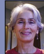
Carmen Club Rep.