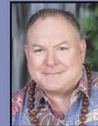
Gene Club Rep.